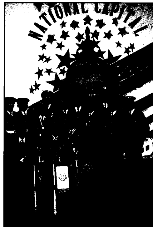
This signature 16' NCDC banner gives all teams an attractive photographic backdrop

Other very strong finishers in the Unarmed Division included: the Yellow Jackets of Randolph-Macon Academy, VA (2nd place-Color Guard); the Chosen Few of