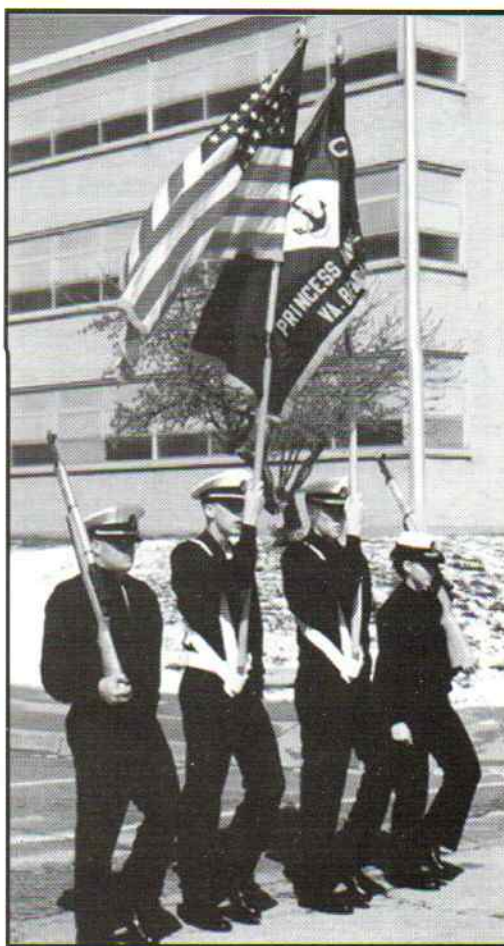
Neither snow nor cold could keep Princess Anne H.S. from a 1st place finish in the Color Guard competition.

After two years at Great Lakes, Illinois, the 2001 NJROTC Nationals will be moved to the Eastern U.S. for the first time since 1996. Pensacola Naval Air Station will be the home for the 2001 NJROTC Nationals and the Navy's best are already working toward the April 6 th -7 th event. Sports Network is honored to continue our association with this amazing event and remain confident that the 2001 NJROTC Nationals will remain the most AWESOME display of Naval excellence!