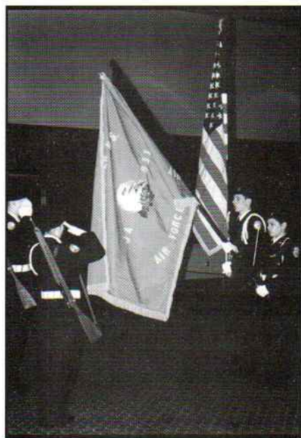
The Shogun Guard of Edgren HS from Japan made Nationals history as our first overseas competitor.

The four events within the Armed & Unarmed Divisions (Inspection, Regulation, Color Guard, Exhibition) gave all teams a chance to display their unlimited hours of practice and preparation throughout the year. Scores in some cases were so close, many winners were not confirmed until just before the start of the Awards Ceremony!