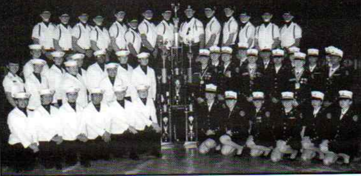
National Champions Winston Churchill HS from San Antonio, TX (top); Flour Bluff HS from Corpus Christi, TX (left) and Fern Creek HS from Fern Creek, Kentucky (right) took the three Masters Level Overall National Championship titles in Daytona Beach.

One king remained while two others were vanquished from their thrones. The struggle to remain on top was brutal — and fun to watch!