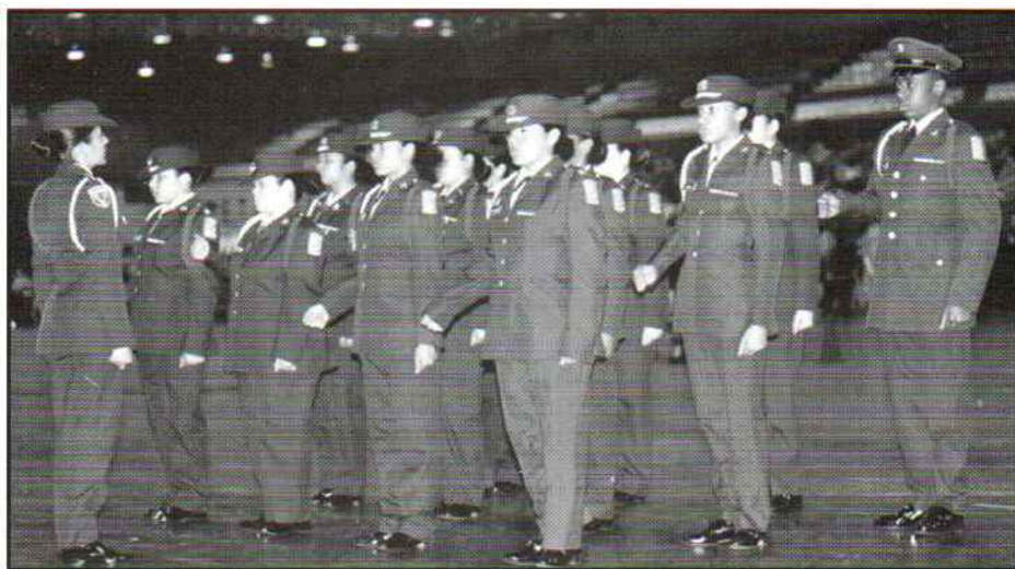
T.C. Williams HS of Alexandria, Virginia is the reigning powerhouse at the NCDC. Capturing both Armed & Unarmed Overall titles, the Armageddon Red & Blue teams have set the standard in the nation's capital.

Sports Network would like to thank everyone who makes the NCDC the impressive event it has become. The dedicated schools throughout the 1st Region, 4th Brigade are already tightening their boot straps getting ready for the 10th annual NCDC scheduled for Saturday, March 17th, 2001 .