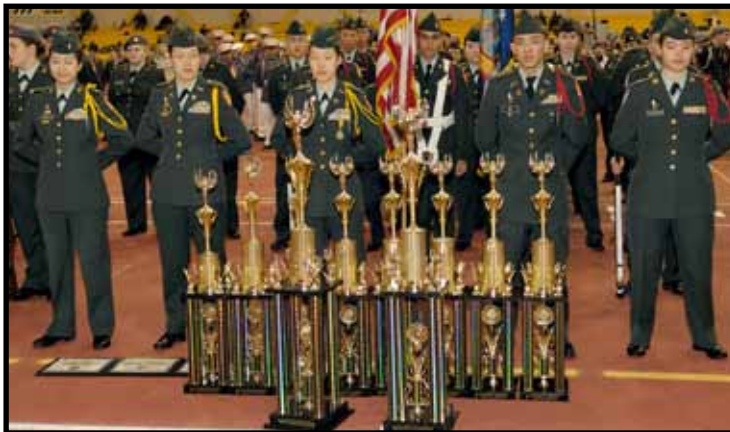
U.S. Army Cadet Command Eastern Division Armed & Unarmed Champion Francis Lewis HS from Fresh Meadows, New York stand behind the fortress of trophies earned at the event. Their margin of victory was unprecedented with so many good schools attending.

The battle for Division Runner-up honors was a three horse race that came down to the wire. McNair Academic HS from Jersey City, New Jersey looked very strong. When the dust settled, the Tanko-Woosas drill team experienced a deja vu finish by repeating their 2006 Division Runner-up placement by AGAIN gaining four trophy finishes with a single 6 th place finish (this time in Exhibition) just as they had done the previous year! They needed every point as both T.C. Williams HS from Alexandria, Virginia and Long Island City HS from Long Island City, New York were in hot pursuit, with both teams earning four team trophies in their own right to clean up virtually all of the top finishing trophies between them!