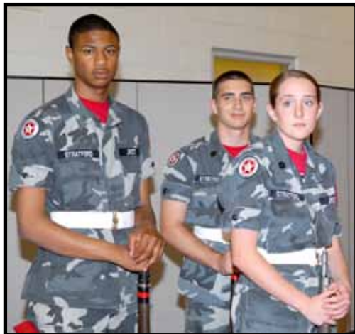
Members of the Stratford Knights drill team from Stratford HS in Goose Creek, South Carolina scope out the the Armed Exhibition drill area before they dazzled the judges and took home a well-deserved 3rd place trophy.

Just a few miles north of the often referred to "Shining City on the Hill," over 40 Army Junior ROTC programs descended on Landover, Maryland to participate in the largest single-day, Army-only championship competition in the world. Schools from Rhode Island to Florida and all points in between put months of training