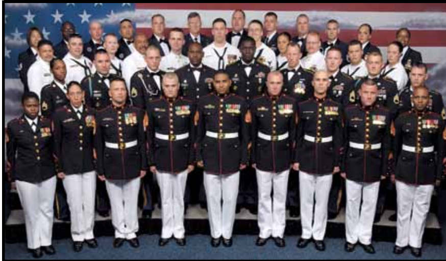
Judges listed from left to right, front row to back row: