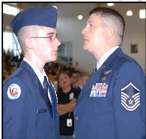
Inspection competition judges look for the smallest of details to allow them to separate the best teams for trophy placement.

SCORES OF HIGH-FLYING BLUE-SHIRT DRILLERS STORMED THE FLOOR IN 2007. TALENTED COMPETITION DRILLERS FROM THE JROTC MECCA OF TEXAS CAME LOCKED AND LOADED BUT SEVERAL DOZEN OF THE STRONGEST DRILL PROGRAMS ACROSS THE EASTERN UNITED STATES FROM MASSACHUSETTS TO FLORIDA WERE READY FOR THEM. THROW IN A FEW ADDITIONAL PROGRAMS LOOKING TO SNEAK UP ON THE TITLE FROM MICHIGAN AND COLORADO AND THEN ADD A DASH OF KICK-BUTT COLOR GUARD FROM THE HARD-CHARGERS AT JENKS HS IN OKLAHOMA, AND YOU HAVE ALL THE EARMARKS FOR AN AMAZING COMPETITION. AND OF COURSE, THE 2007 EVENT DID NOT DISAPPOINT AS TALENTED, DEDICATED CADETS WERE EVERYWHERE!