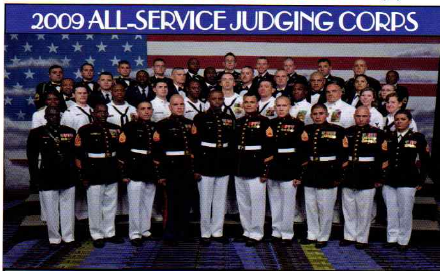
Judges listed from left to right, front row to back row: