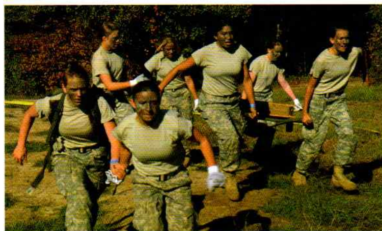
Motivation and determination are both tested when you tote the rucksacks and the heavy stretcher the entire course during the rugged Cross-Country Relay event.

and transporting the gear and the team across the creek). However, Francis Lewis HS from Fresh Meadows, New York showed that spinning a drill rifle is just one of their many talents as they captured both Female Division 5-Mile Run and the Cross-Country Rescue (team carries SIX heavy rucksacks and one 95lb. stretcher through a 1.5 mile-plus wooded course). Then national Raider powerhouse Smith-Cotton HS from Sedalia, Missouri quietly began compiling 2 nd and 3 rd place finishes in four of the five team events and almost without notice moved into strong contention for the championship as well. The division would simply come down to how the units finished in the other events that were not their strongest! By a single quality point (or by just 15 added push-ups & curl-ups out of 1,500 total), the Grissom Femurs grabbed an agonizingly tight Overall Female Division Championship over the Patriettes from Francis Lewis HS who settled for the Female Overall Runner-up crown.