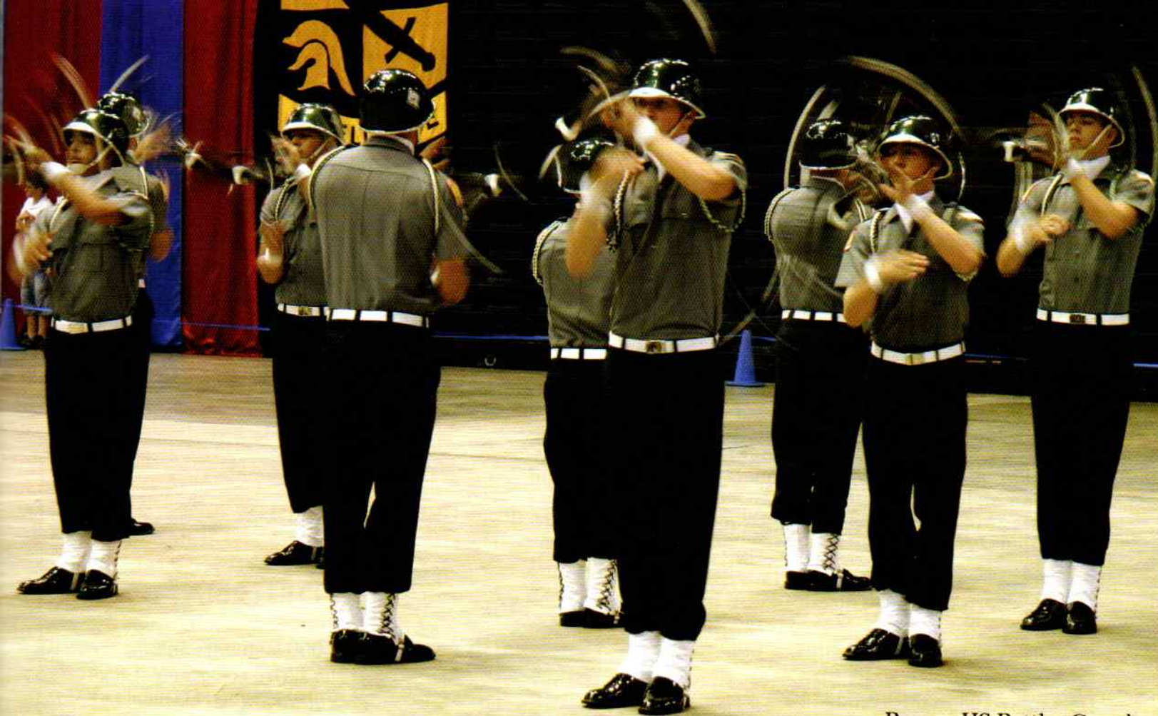
Reagan HS Rattler Guard

the BEST in drill equipment and uniform accessories for JROTC, honor guards, color guards, drill teams, rifle teams and individual cadets