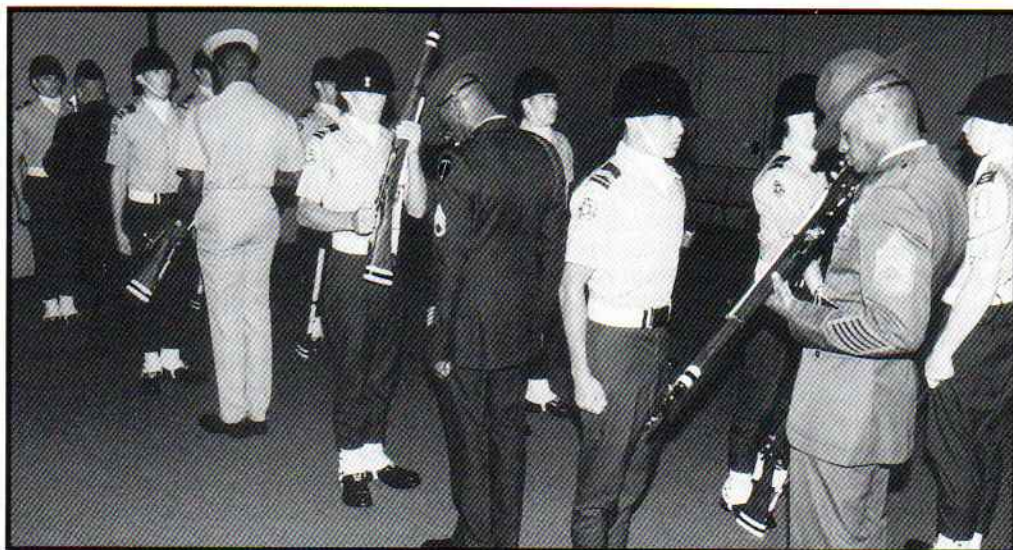
Central Catholic High School displays San Antonio excellence during the Unit Inspection event.

Strangely, while all of these drill coaches work closely with their units, at a drill competition you might not even notice them. You just don't see the proverbial "Mother Hen" syndrome with units from the San Antonio area. Unlike those instruc-