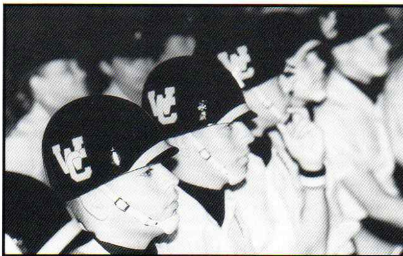
Winston Churchill High School look on at their first National's Awards Ceremony.

SN1 salutes each of these phenomenal schools. They will go anywhere at any-time to put their ability on the line. A word of advice to their competition..... Practice, Practice, Practice!