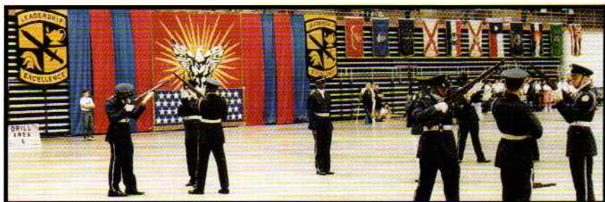
The Lords of Discipline from Oxon Hill High School in Oxon Hill, Maryland display the four corner box that has become a standard during Exhibition drill at the Nationals.