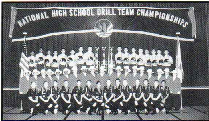
Demilitarized Division: Top-Theodore Roosevelt High School - San Juan Guard Unarmed Division: Middle-Theodore Roosevelt High School - Riderettes Facsimile/Female Division: Front-Enterprise High School - Belles of the Blue Knights

Can anyone stop these dynasties in 1995?