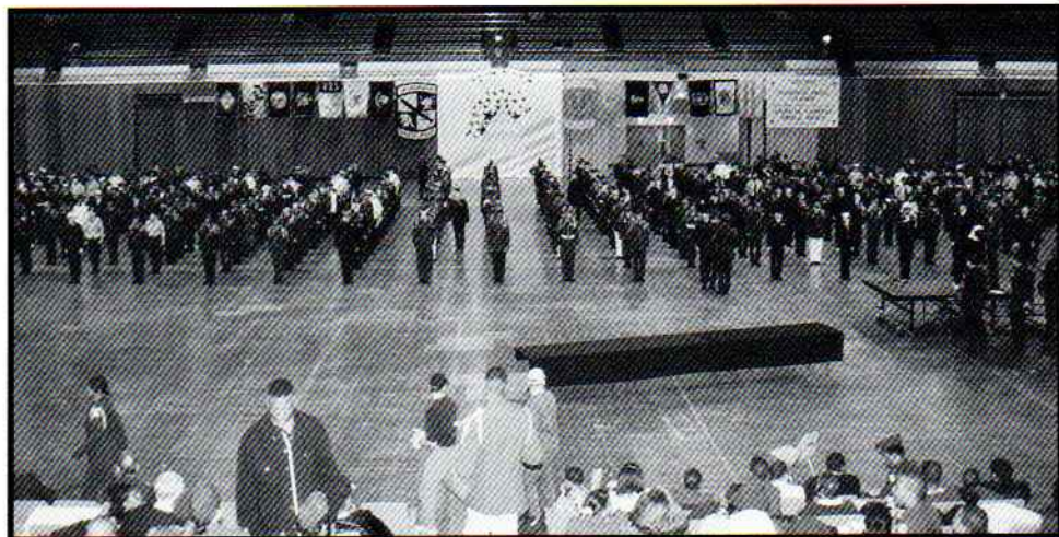
Knockout drill puts on display the esprit-de-corps that is the hallmark of Junior ROTC & the NCDC.

Finally, the presentation of stunning team trophies by the head judges in each event topped off the evening. Overall, the 1994 National Capital Drill Classic proved to be a fantastic regional drill meet for all who attended. Many changes are underway for the 1995 NCDC. Teams eligible to attend have been mailed an invitation with this magazine. For more information on the 1995 NCDC, please contact Sports Network International at 800/327-9311.