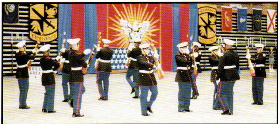
Precision remains the benchmark within the Marine Corps, best displayed during Platoon Exhibition drill at the Nationals.