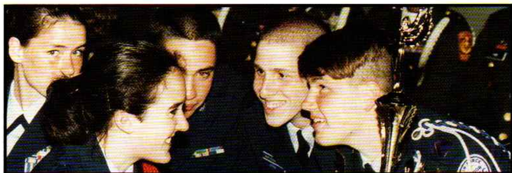
Fellowship and excitement are the buzzwords at the National's Awards Ceremony as cadets from Coventry High School in Coventry, Rhode Island get a chance to share experiences with cadets from the Newburgh Free Academy in Newburgh, New York.