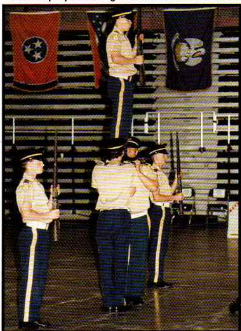
The Northridge Rifles of Chattahoochee High School in Alpharetta, Georgia display the two-man rifle stand they have become famous for.