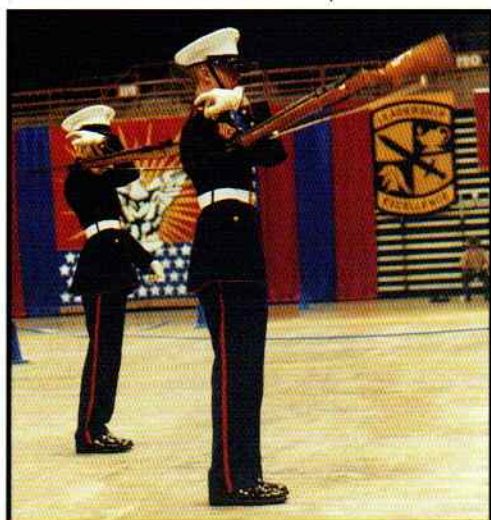
Individual & Dual Exhibition competitions are always among the most coveted titles earned at the Nationals.