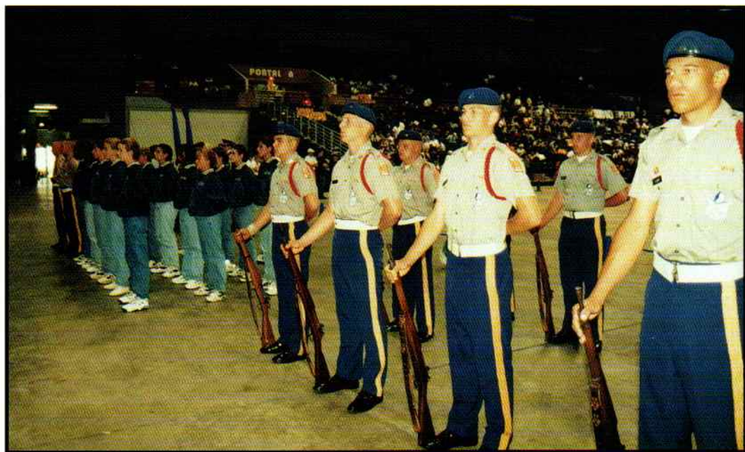
Shown in formation preparing for Squad Exhibition Drill, the Blue Knights male drill team from Enterprise High School in Enterprise, Alabama readies for drill with support from their impressive female counterparts, the Belles of the Blue Knights.