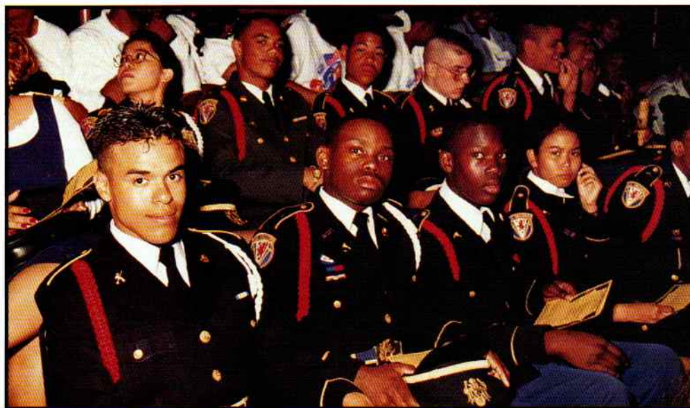
Excited cadets from the T.C. Williams High School Army Junior ROTC unit in Alexandria, Virginia wait with anxious anticipation at their first Nationals Closing Night Awards Ceremony.