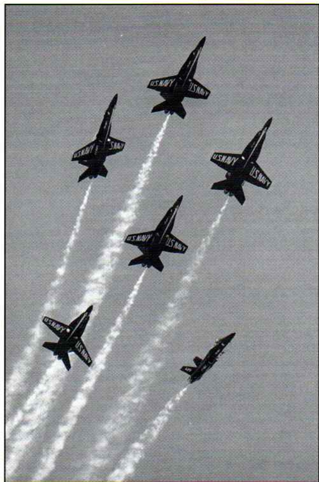
The distinctive blue & gold markings of the Blue Angels demonstration team punctuate a six-plane maneuver on display during this "high" show.

Fat Albert is manned and flown by an all-Marine Corps crew of three pilots