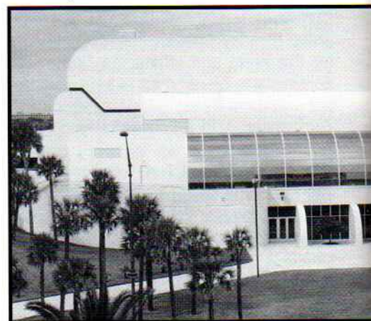
The Ocean Center Arena in Daytona Beach, Florida is the

The National High School Drill Team Championships are held at the impressive Ocean Center Civic Arena in Daytona Beach, Florida in late Spring every year. This state-of-the-art facility features permanent seating for over 6,000 with outstanding amenities for a drill competition the size and prestige of the Nationals. The Ocean Center also features a complete concession area, plentiful bus & car parking and ample male and female dressing rooms with full shower facilities. All cadets and instructors who attend the Nationals will attest that the Ocean Center remains the most exceptional drill & ceremony facility currently in use in the United States.