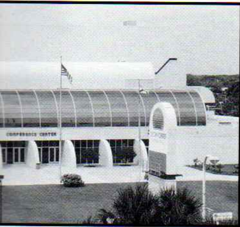
magnificent drill & ceremony facility utilized in America.

Team events in each one of the competition divisions will be trophied in first through fifth place . Additionally, all schools who compete for a National Championship (those schools entering every team event within a division) will receive a personalized NHS DTC school plaque.