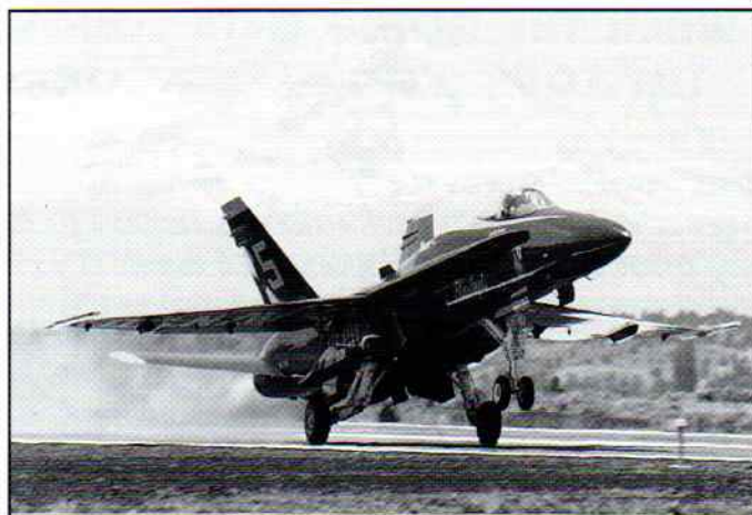
The F/A-18 Hornet's combination of high-power and light weight give the aircraft great maneuverability, climb and acceleration, important in combat and at air shows.

Over 110 Navy and Marine Corps enlisted personnel are assigned to the Blue Angels and tasked with support duties. Their typical tour of duty is 3 years.