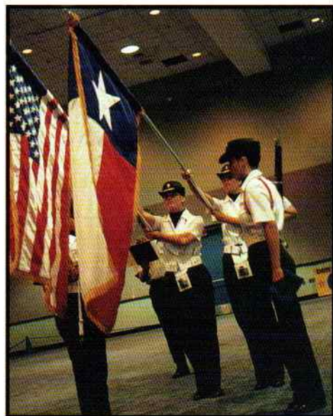
Exceptionally well-disciplined Color Guard units from Texas have set a standard of excellence at the Nationals.