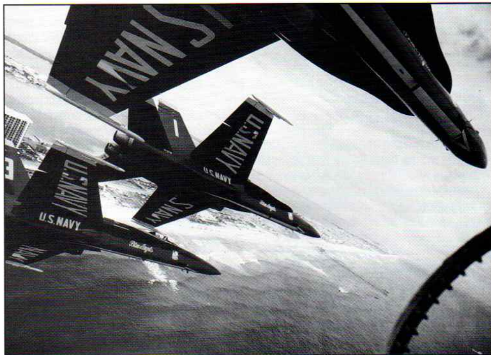
Flying at speeds approaching 1,000 MPH within just a few feet of their teammates, the Blue Angels dazzle millions of spectators at air shows around the country with their precision flying.

The squadron spends the winter based at sunny El Centro Naval Air Facility in El Centro, California. Here they train their pilots and new crew members, learning to work together as a team and readying themselves for their demanding show season.