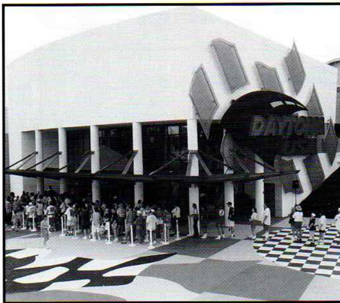
A one-of-a-kind experience, Daytona USA opened to during the 4th of July holiday to thousands of thrilled racing fans, as they line up for the "Ultimate Motorsports Attraction".

Visitors to Daytona USA are able to participate in a "hands-on" Winston Cup stock car pit stop, design their own race car, video-talk to famous race drivers & drive in a simulated NASCAR race through video. Daytona USA also has an interesting history of racing museum, the chance to call a NASCAR race as an announcer and a heart-stopping video presentation of the Daytona 500 with surround-sound realism on a 25' x 55' monster screen.