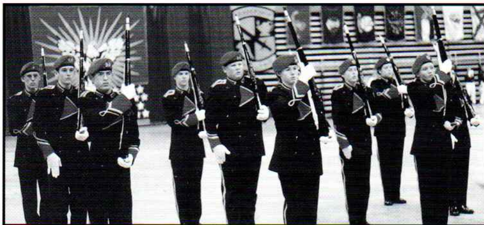
Difficulty, originality, showmanship and flawless perfection are the cornerstones of every award-winning exhibition routine. Featured on the 1996 Best of Exhibition Drill videotape are many of the nation's finest drill teams. Above, the Army JROTC Gladiators of Mattoon HS, Mattoon, Illinois display their top-flight platoon exhibition performance at the Nationals.

If you're in the mood for the Florida tourist experience, there is still no substitute for "Theme Park Heaven" just 60 minutes away in Orlando! Day trips to Walt Disney World, Wet & Wild, Universal Studios, Sea World and Kennedy Space Center (located in Titusville), are still very popular excursions. But with Daytona Beach offering more exciting ways to spend your vacation, people are coming to the World's Most Famous Beach...and staying here! ❖