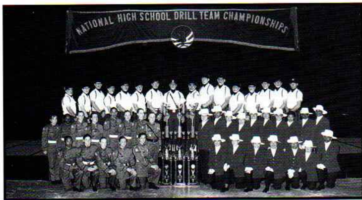
Demilitarized Arms Division: Top - Winston Churchill High School - Black Watch Unarmed Division: Front Right - Theodore Roosevelt High School - Riderettes Alternative Arms Division: Front Left - Oak Ridge Military Academy - Lady Cadets

All three competition divisions were up for grabs until the final scores were tallied. Fierce, unyielding, breathtaking team performances helped to field a most outstanding National drill event in 1996.