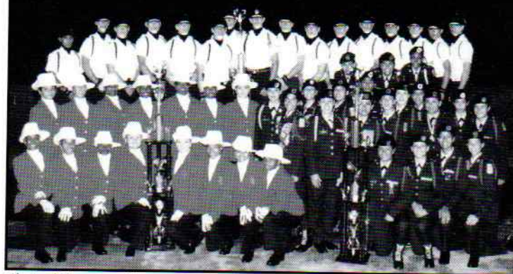
National Champions Winston Churchill HS from San Antonio, TX (top); Miami Coral Park HS from Miami, FL (right) and Theodore Roosevelt HS from San Antonio, TX (left) grabbed the three Masters Level Overall National Championships in Daytona Beach.

Throughout the world, schools annually dream of making a trip to the finest drill event in the world, the National High School Drill Team Championships. The performances on display at the 1999 event continue to explain why "The Nationals" have grown to become the standard by which all other drill & ceremony events are measured.