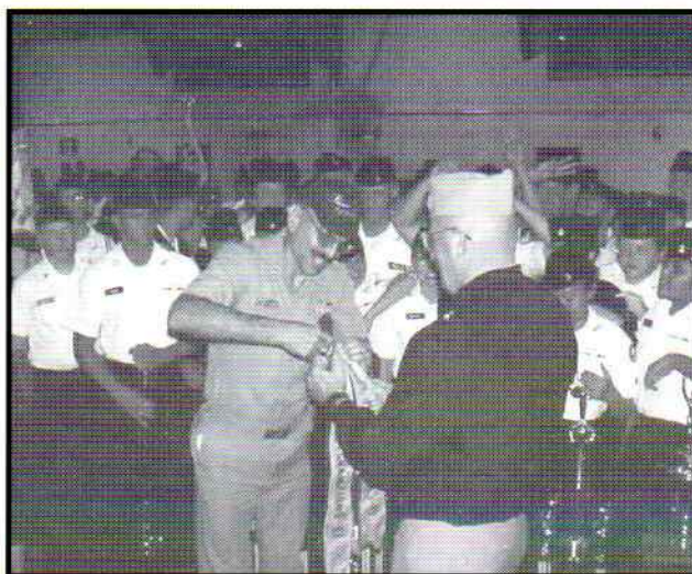
Cadets and instructors beam with pride as Flour Bluff H.S. carts home the trophies that come with capturing the NJROTC Nationals Championship.

The weekend at Great Lakes was both an exciting and challenging experience for all, with excellence around every corner. The Navy's best and brightest are already gearing-up for the 2000 NJROTC Nationals, scheduled to return to Great Lakes on April 7th-8th. Sports Network Int'l is honored to have produced the 1999 event and is confident that the 2000 NJROTC Nationals will surpass all expectations.