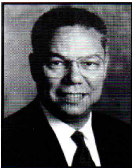
General Colin Powell, U.S. Army, ret.

C olin Powell was born in New York City on April 5th, 1937. General Powell served as the 12th Chairman of the Joint Chiefs of Staff, Department of Defense, from October 1, 1989 to September 30, 1993, under both President George Bush and President Bill Clinton.