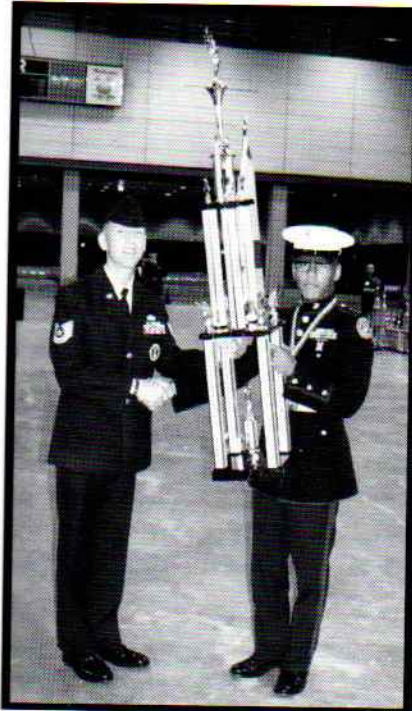
United South High School grabbed top honors in the 1999 Armed Challenge Level competition.

We at Sports Network salute the Challenge level attendees at the Nationals. We were honored by their strong efforts. Win or lose, each of these schools made their mark and bettered their program through their attendance at the Nationals.