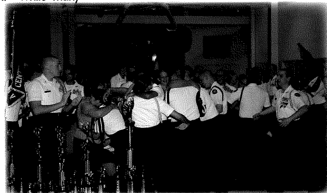
Centennial HS from Las Vegas, Nevada erupted into a mass display of unbridled emotion as they learned they had just clinched their second consecutive Overall Championship at the 2010 Navy Nationals competition.

So the question is thrown - can Centennial hold on once more to solidify themselves as a true NJROTC dynasty? Don't bet against it! Secure yourself a spot at the 2011 Navy Nationals to watch the newest drama unfold for yourself - it should be another amazing, wild ride!